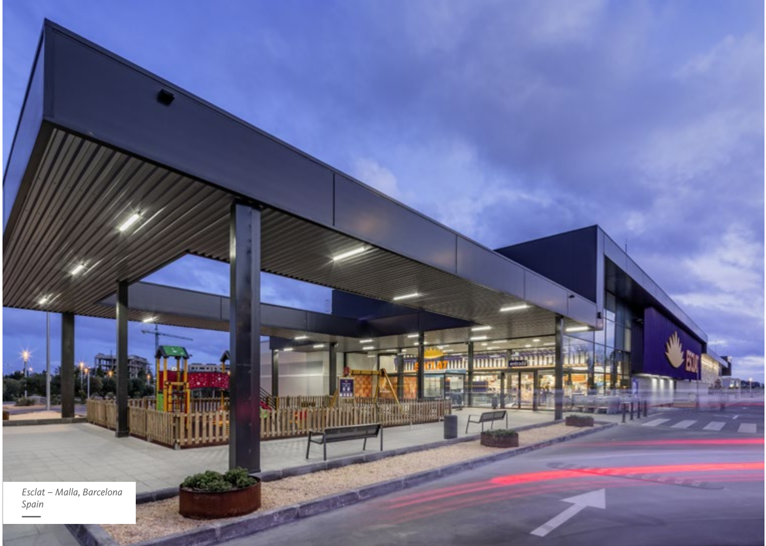
Esclat – Malla, Barcelona Spain