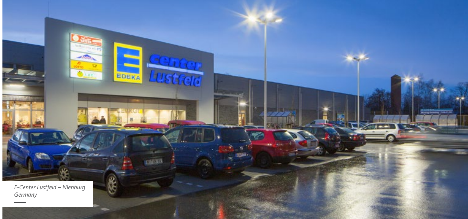
E-Center Lustfeld – Nienburg Germany