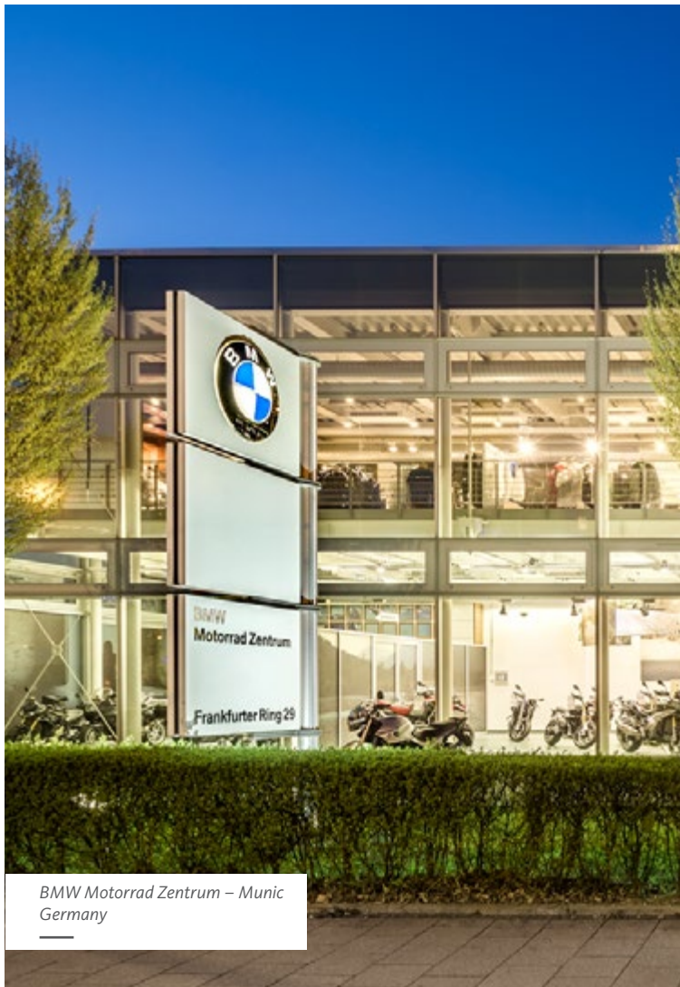
BMW Motorrad Zentrum – Munic Germany