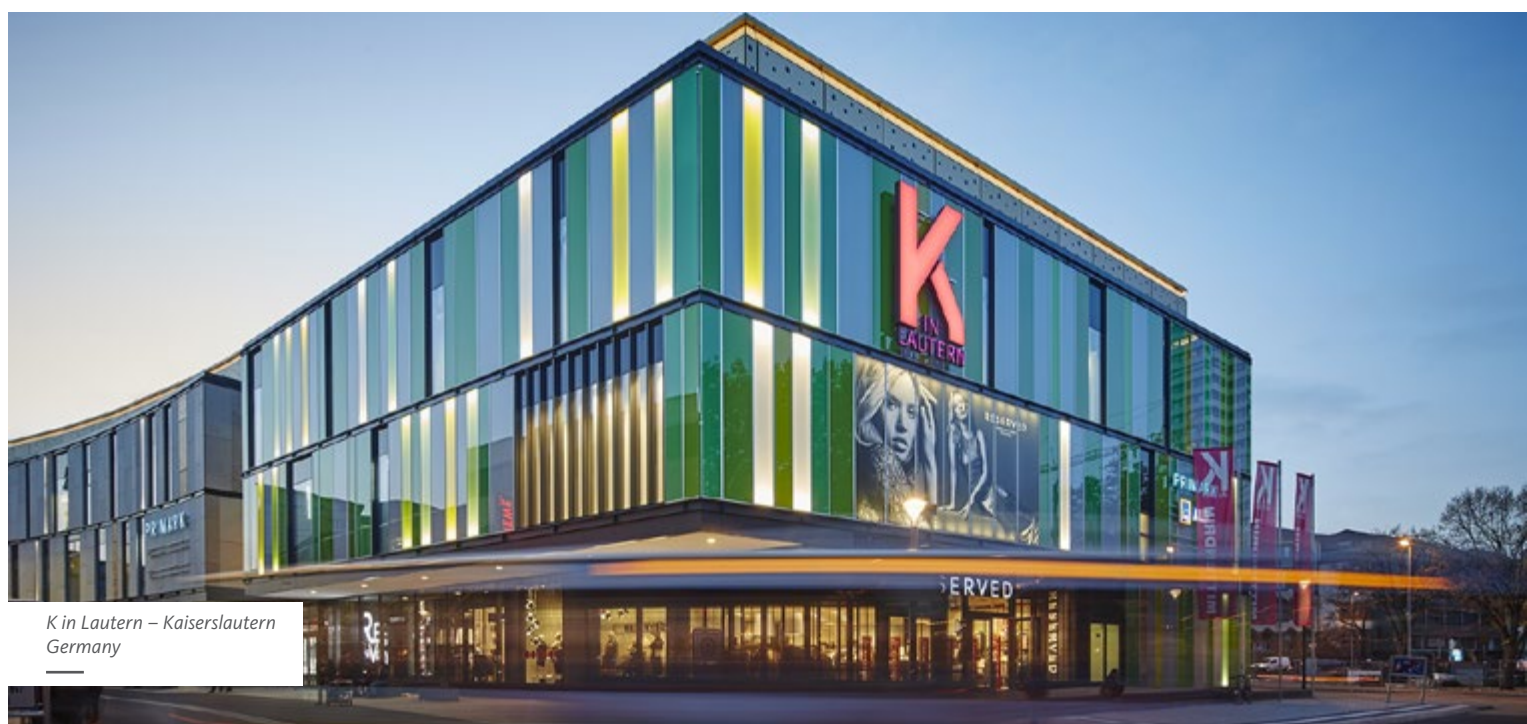
K in Lautern – Kaiserslautern Germany