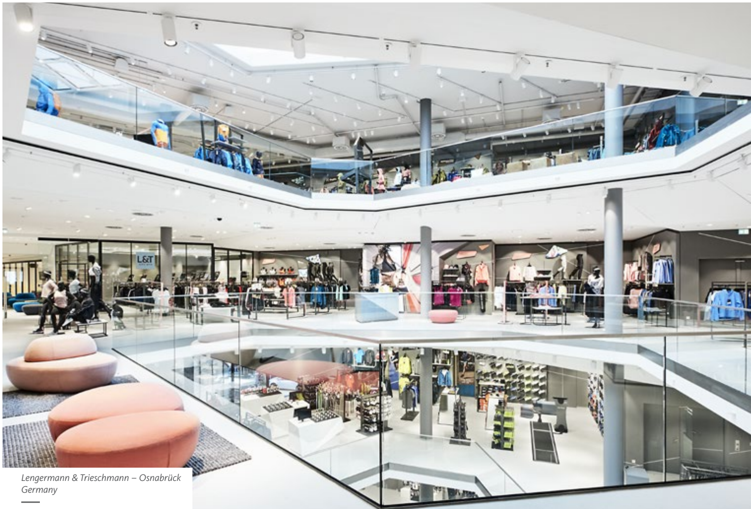
Lengermann & Trieschmann – Osnabrück Germany