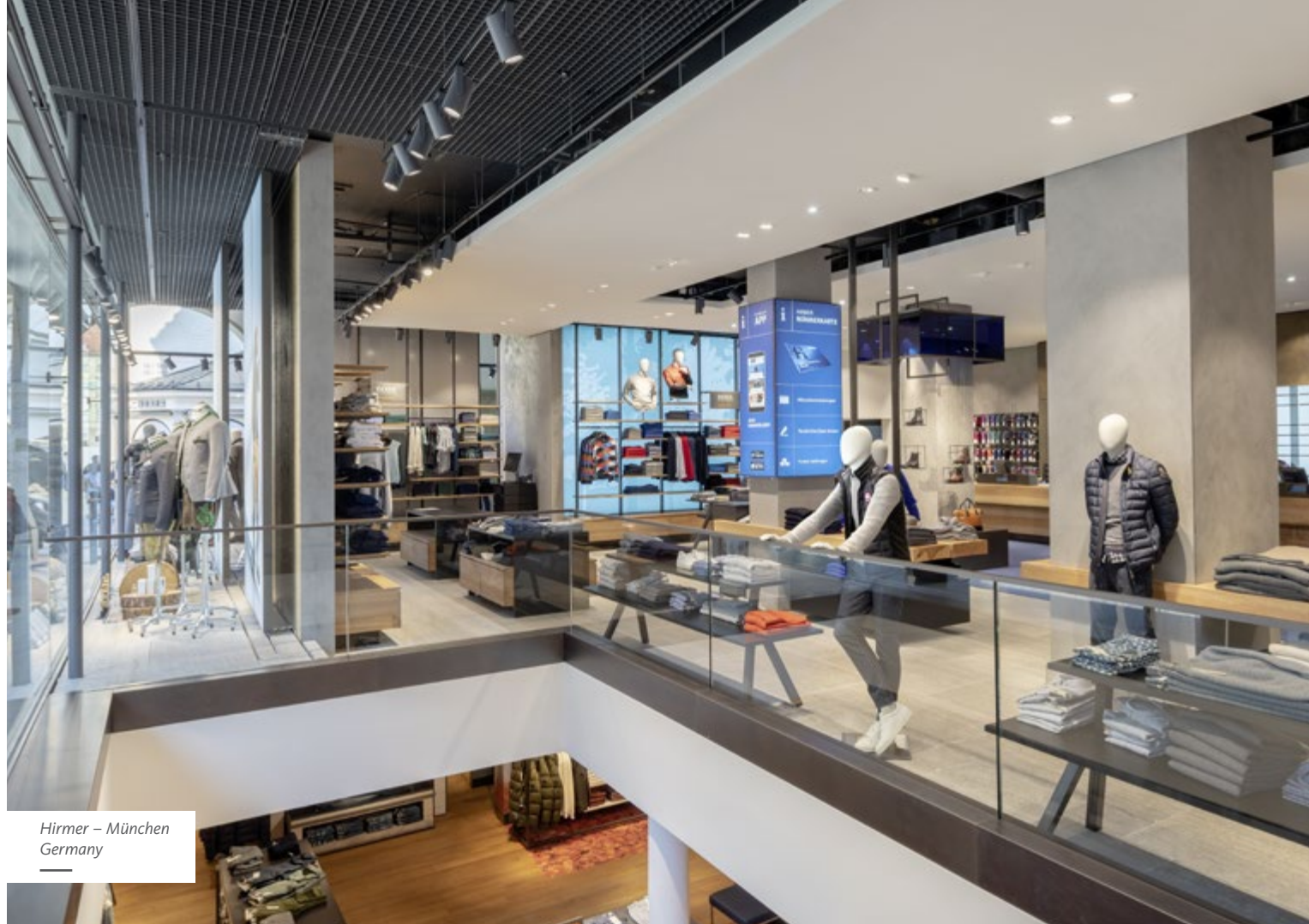
Hirmer – München Germany