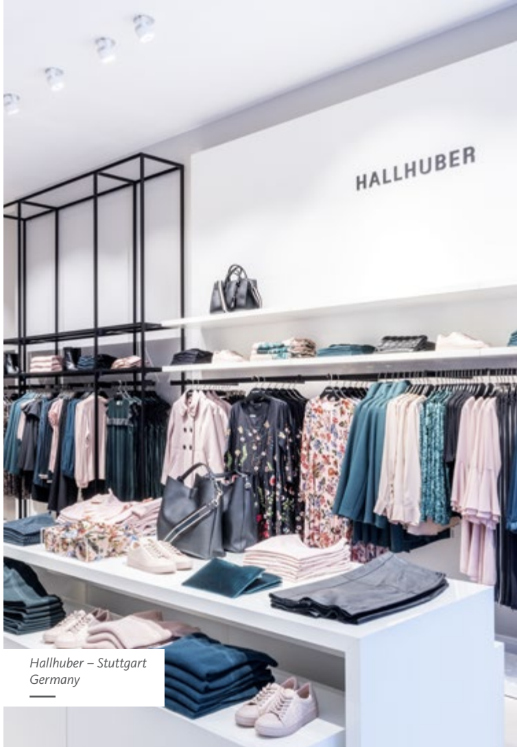
Hallhuber – Stuttgart Germany