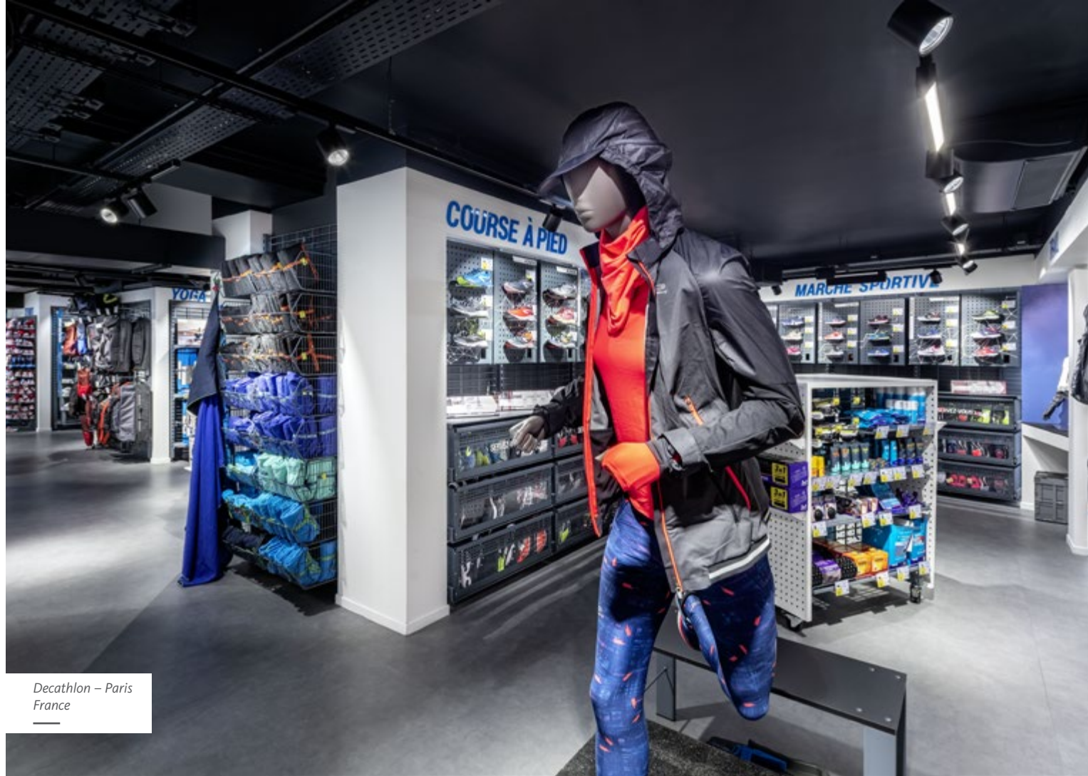
Decathlon – Paris France