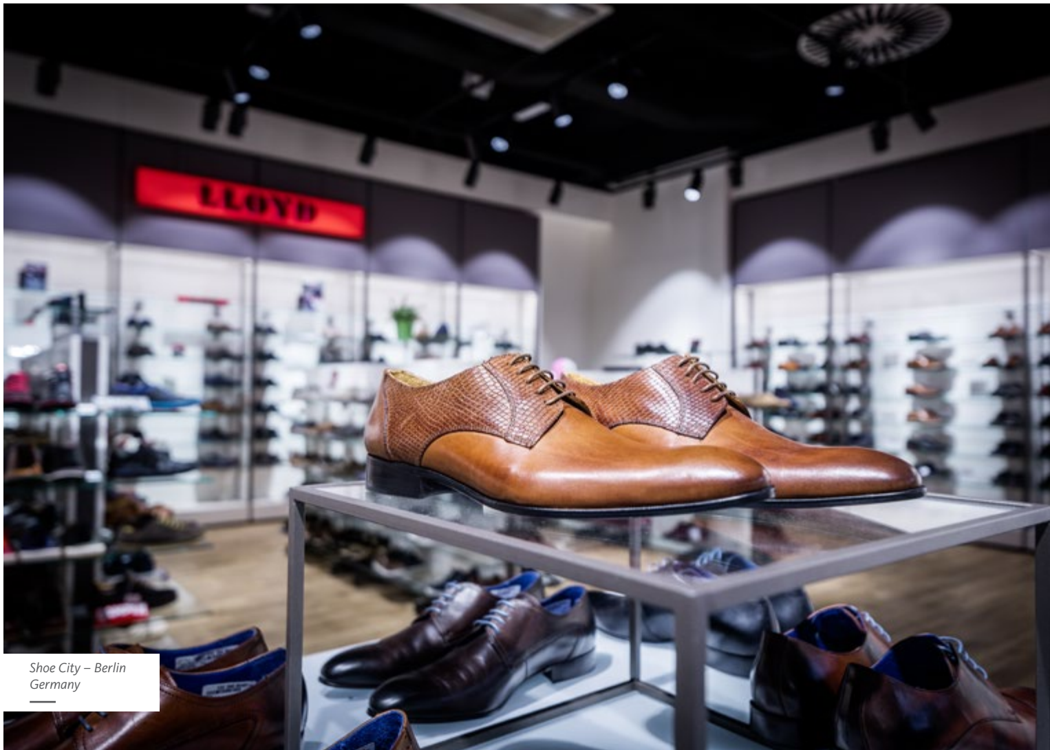
Shoe City – Berlin Germany