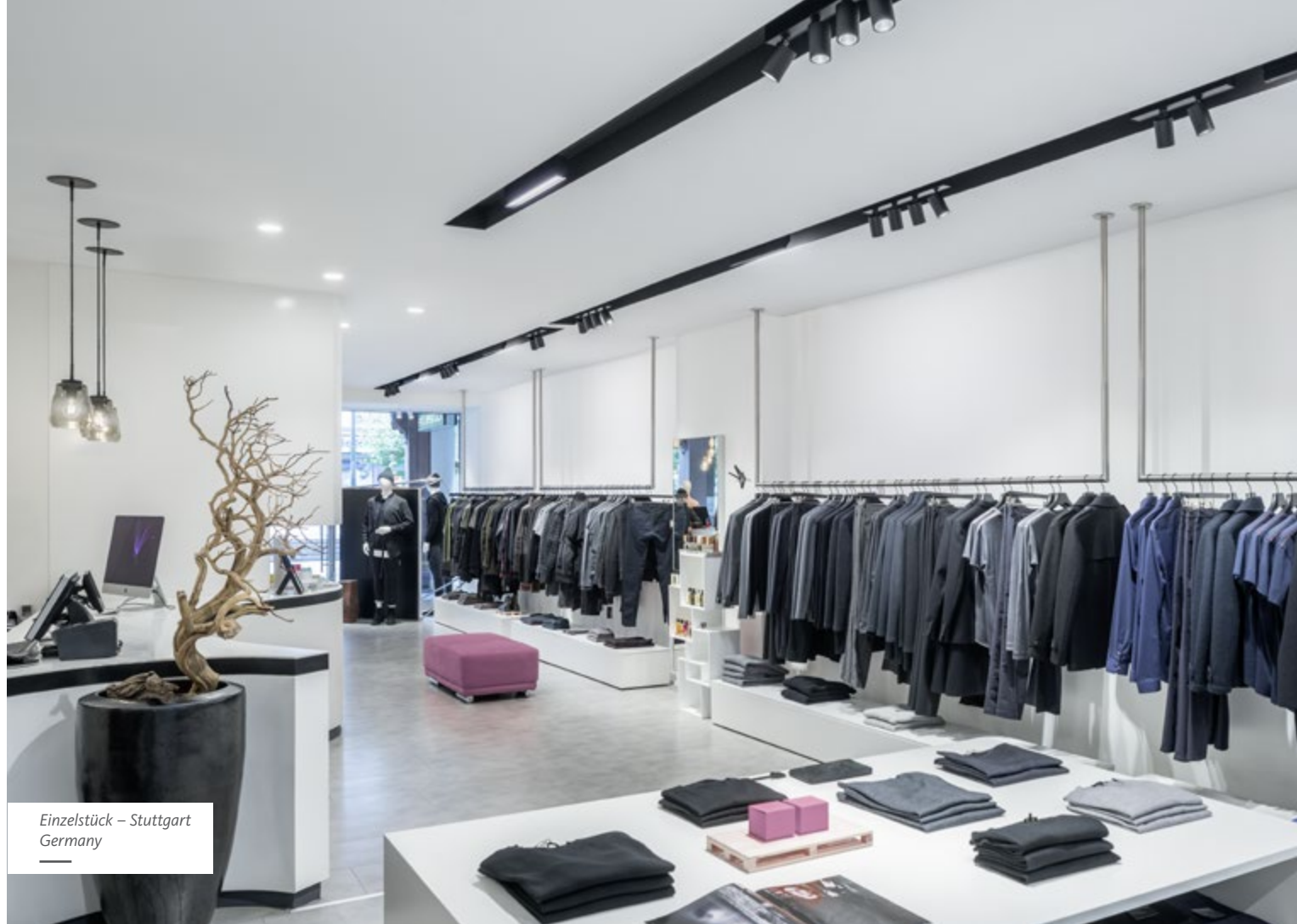
Einzelstück – Stuttgart Germany