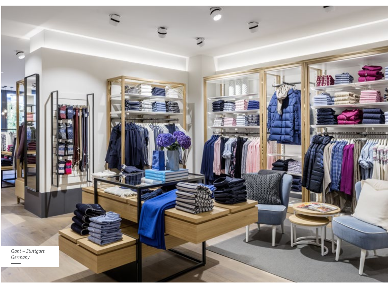
Gant – Stuttgart Germany