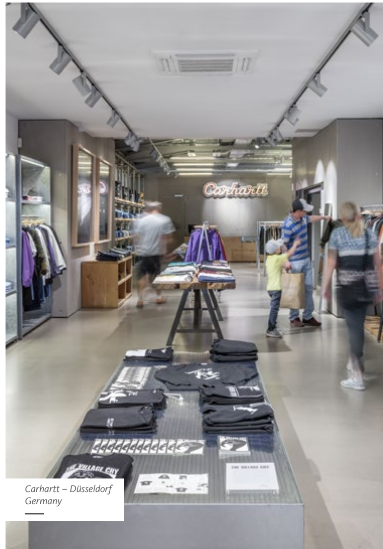
Carhartt – Düsseldorf Germany