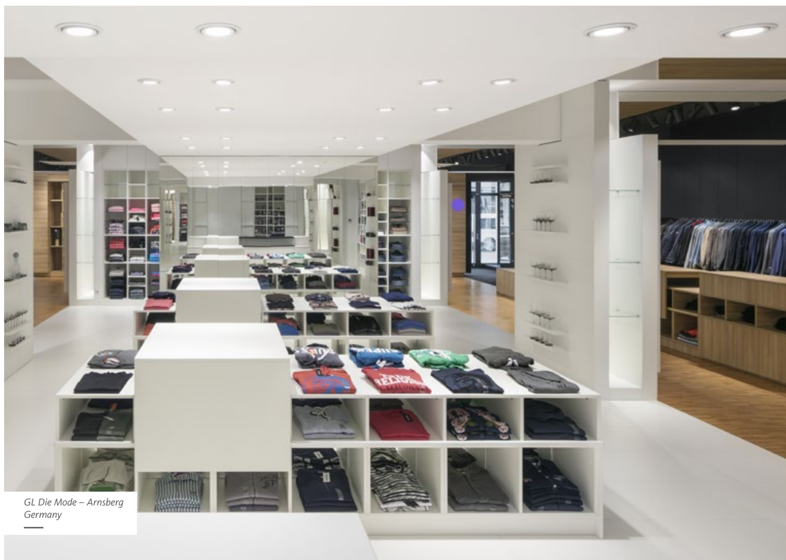
GL Die Mode – Arnberg Germany