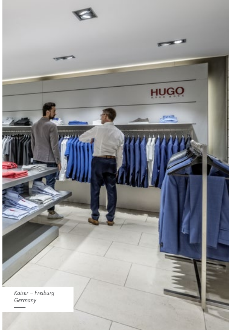
Kaiser – Freiburg Germany