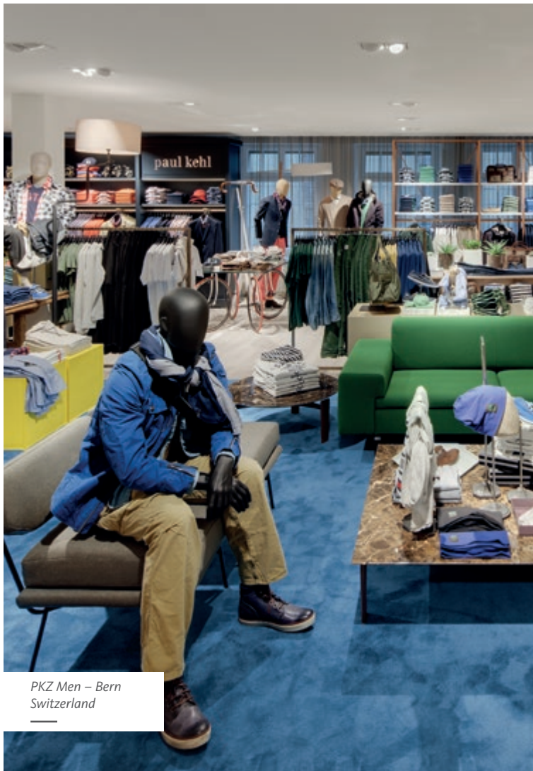
PKZ Men – Bern Switzerland